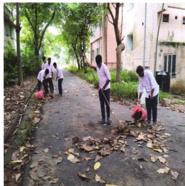
Cleaning campus by Students