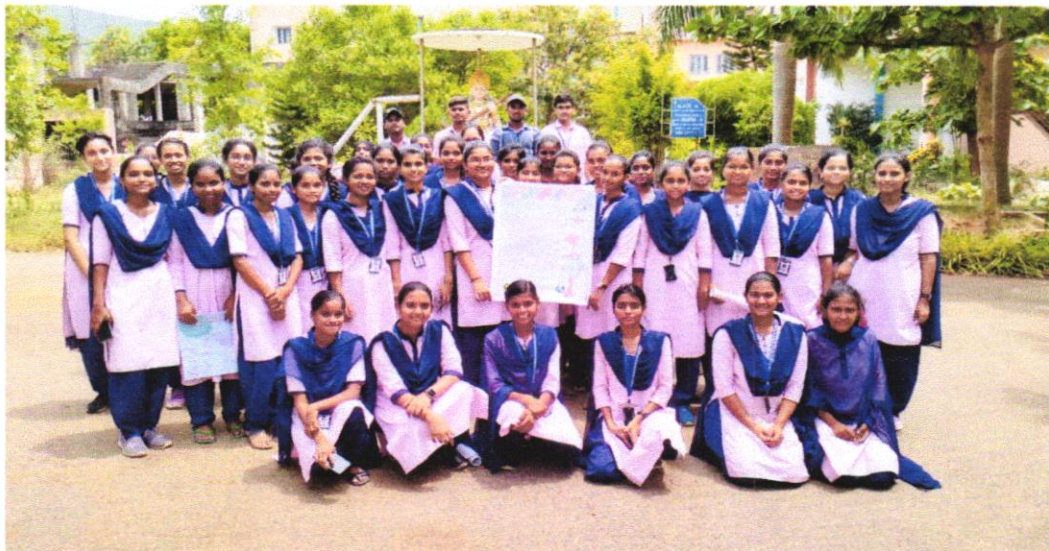
Rally in campus on "Healthy Environment Programme"